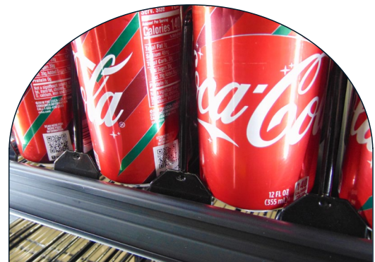
PERFECT PRODUCT PRESENTATION

Shelves can be installed flat or as gravity feed to suit your pack dynamics. Perfect product presentation in your cooler aisle — every time.