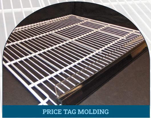
PRICE TAG MOLDING