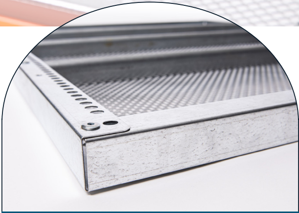
VIEW FROM BELOW