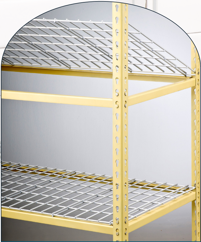
KWIK-SHELF LIGHT-DUTY WIRE SHELVING