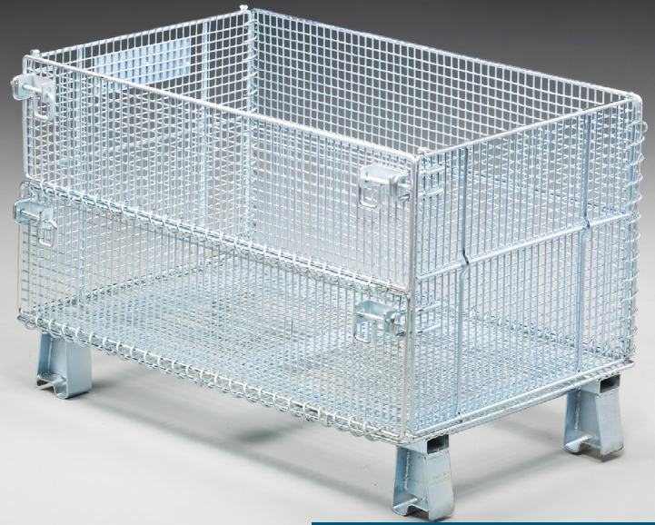
JR5: 1/2 x 1/2 INCH MESH