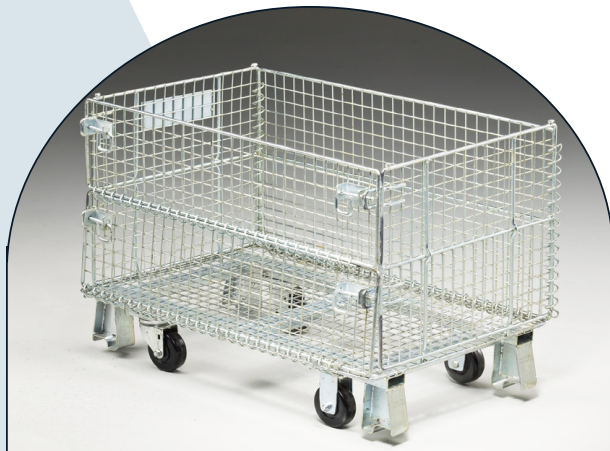
JR1 C WITH CASTERS