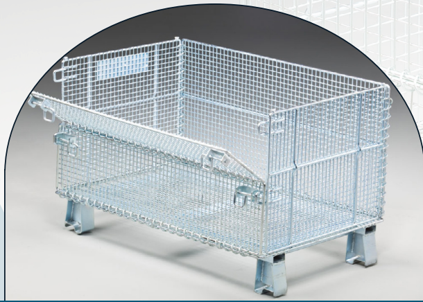
JR5 WITH OPEN SIDE