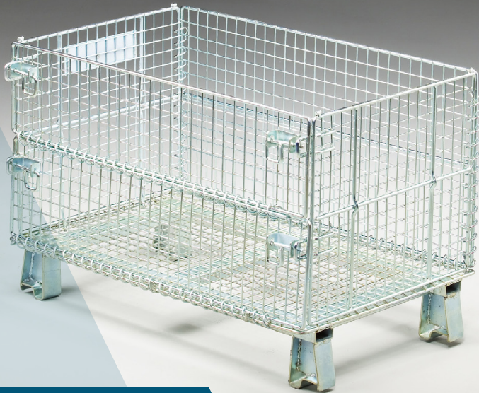
JR1: 1 x 1 INCH MESH